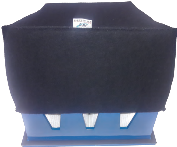
VEE BANK CUBE